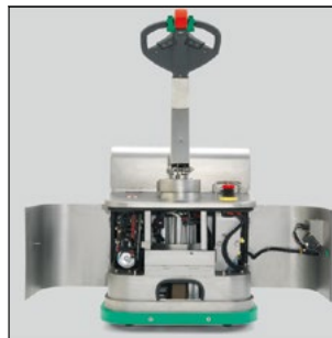
Excellent service access