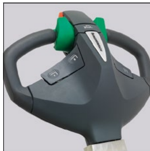
Ergonomic tiller with intuitive buttons