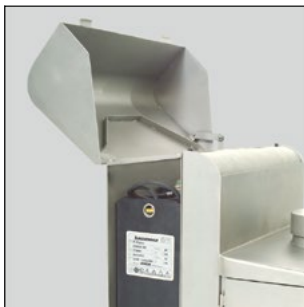
Ready for battery changing: open battery cover and removed side panel